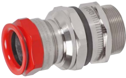
ADE 1F2 ISO