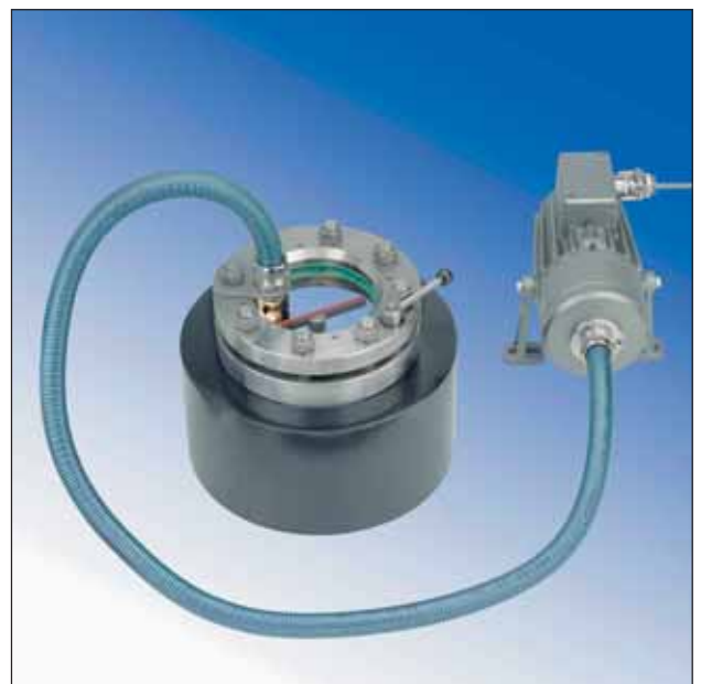
Lumiglas Ex light guide luminaire 'Lumiflex', model USL07 LF-Ex shown mounted on a DIN 28120 flanged sightglass fitting combined with pressure tight Lumiglas wiper unit (Typ SW II BW)