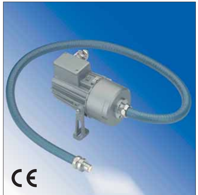
Lumiglas light guide luminaire USL07 LF-Ex