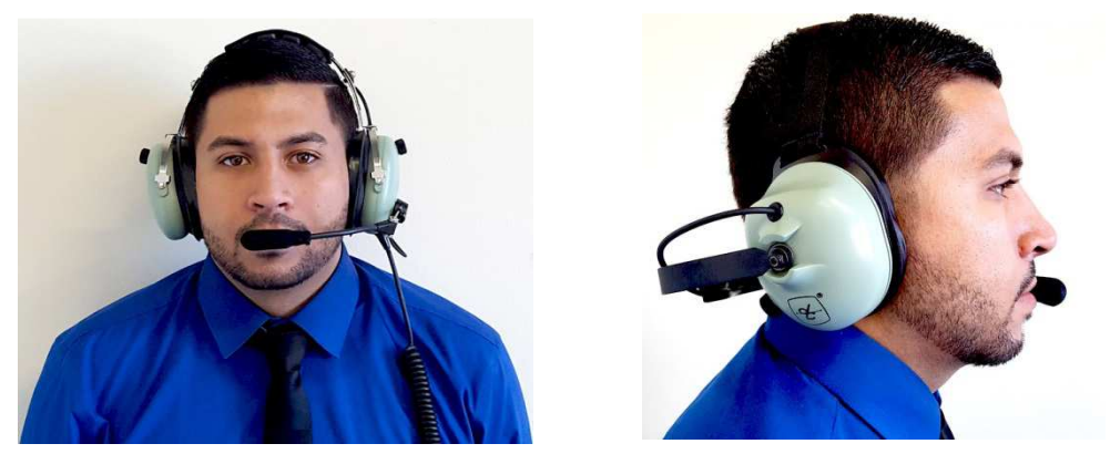
Figure 2: Positioning the Microphone